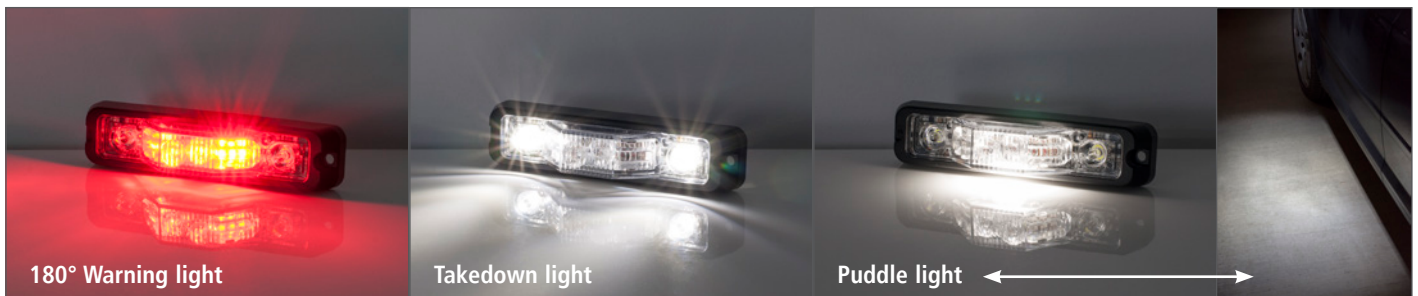
180° Warning light